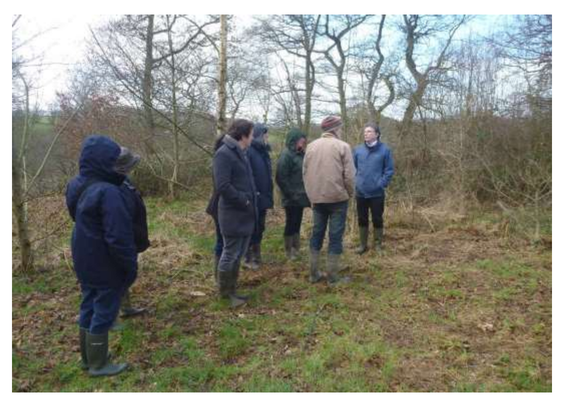
Members of the Montgomeryshire landowner group sharing knowledge

In total, the project worked with 95 individual stakeholders. These were staff representing organisations, landowners/managers and volunteers.