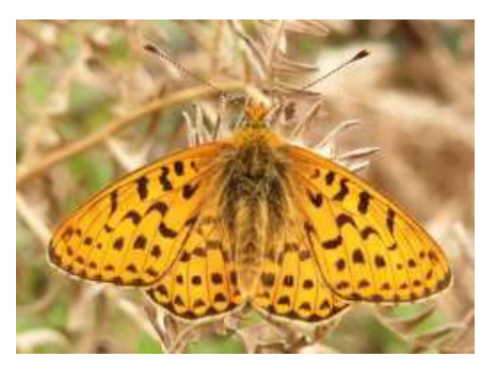
Rare, threatened wildlife (in this case Pearl-bordered Fritillary butterfly) are one reason for LWS selection

The Powys LWS criteria are considered to be appropriate for the selection of quality habitats and species, but should not be seen as being set in 'tablets of stone'. Nature is dynamic and policies and legislation change. It is anticipated that it will be a living document which is regularly updated as and when changes are needed.