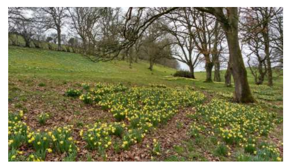
A Wild Daffodil wood in spring, April 2018

Being privately owned, the LWS system has always focussed on simply identifying and selecting sites and working with their owners/managers to ensure good habitat management. Given the increasing challenges from climate change, development, agricultural intensification and so on, leading to continued biodiversity losses and ecosystem collapses, it is time for new ways of thinking to increase ecological resilience. People are the problem, but they are also the solution. It was time to engage with and inform the people of Powys about these special, often unnoticed wild places which surround them, giving them a reason to leave their living rooms and step into a whole new world often just round the corner or down the street; the 'Where the Wild Things Are' project was born.