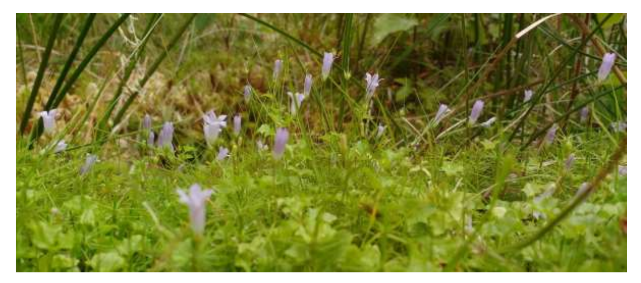
Ivy-leaved Bellflower; an uncommon plant which grows in wetland habitats

and it certainly put some people off. Although we exceeded our target of 60 participants (239), this was due to many individuals which we thought were stakeholders, being reclassified as participants. Had this been made clear at the start of the project, along with an opportunity to amend the targets on the basis of the written definitions, this would not have been an issue.