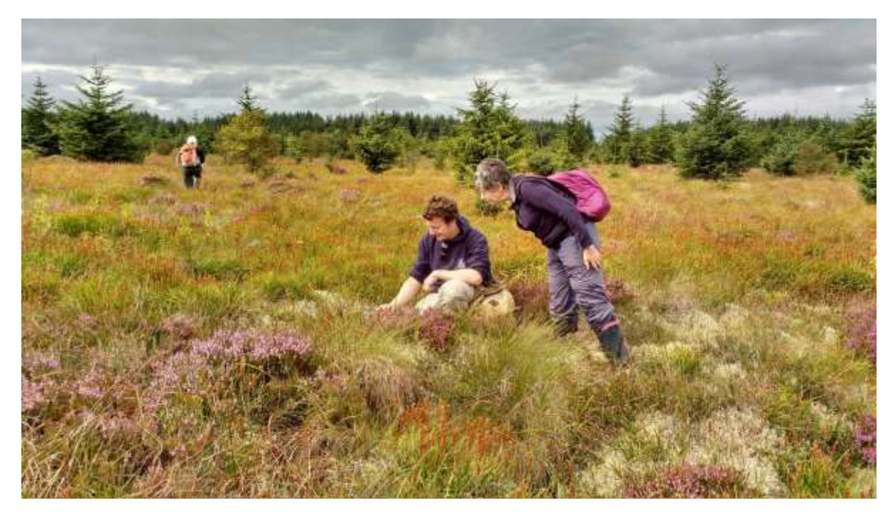
LWS survey on blanket bog, 22<sup>nd</sup> August 2017

Of the sites surveyed, final reports have only been written for 15. The late completion of the criteria review meant that the window for writing these reports was very short. Although an important part of the site assessment and landowner feedback process, the production of these reports was not an output for the project, meaning that time had to be prioritised to those elements which were. The budget for staff time, outside of the Project Coordinator, was too limited budget to allow for other staff to support the task. It is also difficult to assess sites and write reports about them, when you do not know the site or have enough detailed information.