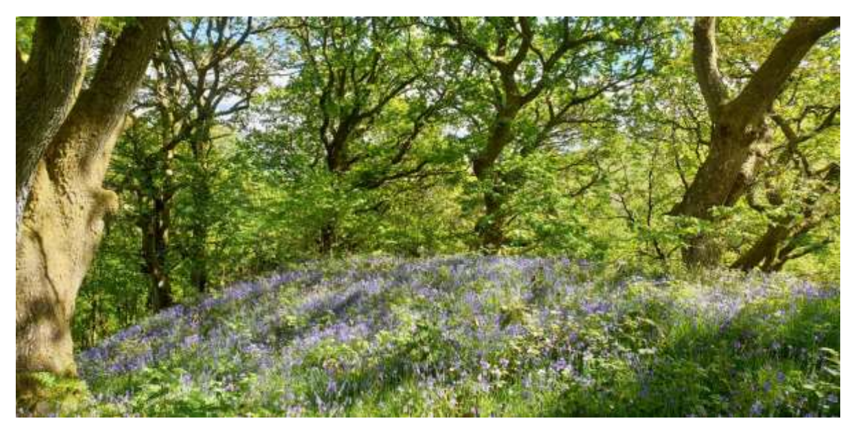
Woodland LWS can provide many ecosystem services

An assessment of some of the ecosystem services provided by the existing LWS network in Powys was made, using the 'Enabling a Natural Capital Approach' (ENCA) (DEFRA 2020).