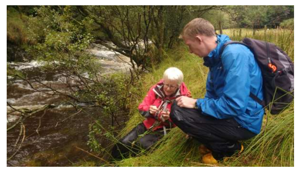
LWS surveys provided a great opportunity to learn from each other

Of the sites surveyed, final reports have only been written for 15. The late completion of the criteria review meant that the window for writing these reports was very short. Although an important part of the site assessment and landowner feedback process, the production of these reports was not an output for the project, meaning that time had to be prioritised to those elements which were. The budget for staff time, outside of the Project Coordinator, was too limited budget to allow for other staff to support the task. It is also difficult to assess sites and write reports about them, when you do not know the site or have enough detailed information.