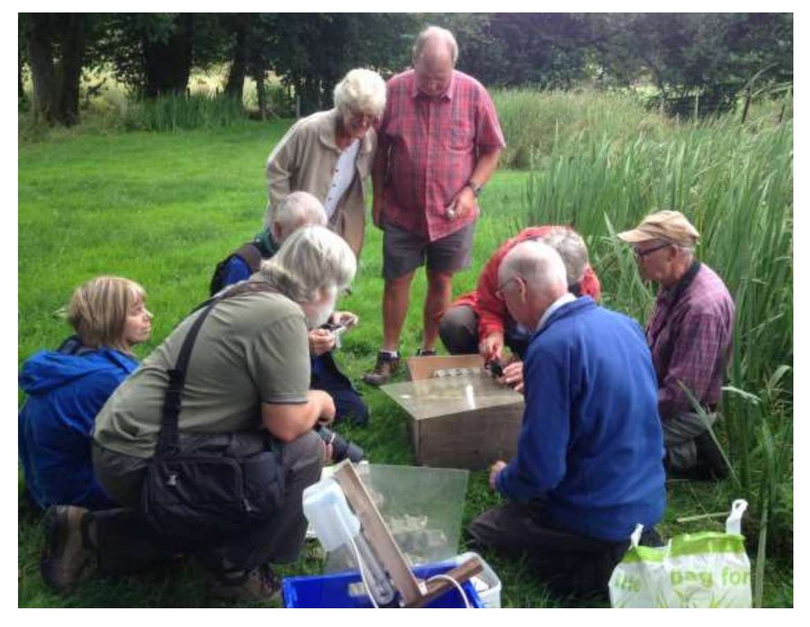
Getting people interested in nature