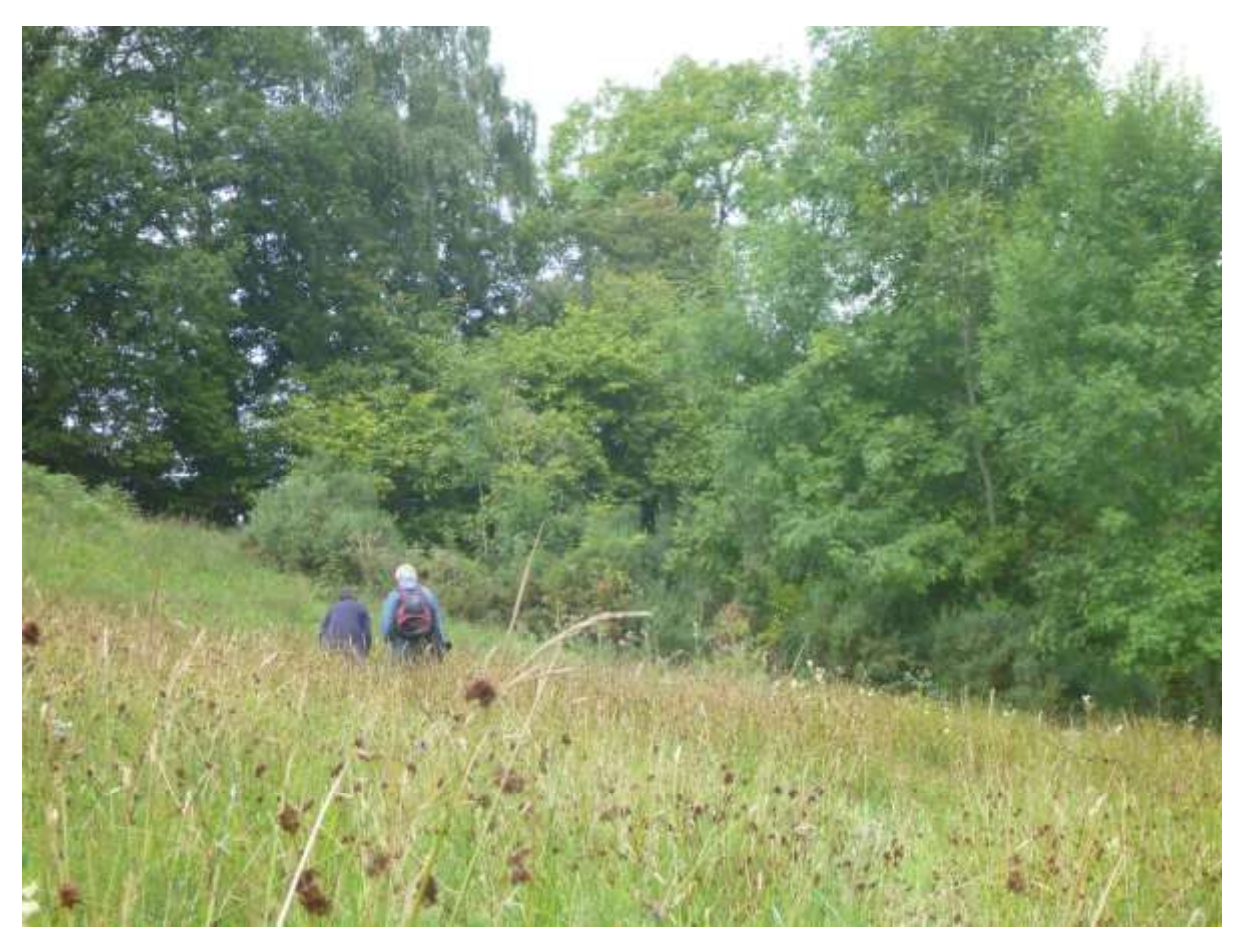
LWS volunteers surveying marshy grassland, 14<sup>th</sup> August 2017

Wales Biodiversity Partnership (2008). Wildlife Sites Guidance Wales: A Guide to Develop Local Wildlife Systems in Wales. Available online at <u>https://www.biodiversitywales.org.uk/Local-Wildlife-Sites</u>.