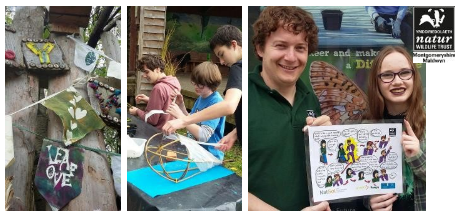
Young people enjoyed the opportunities to get creative with support of staff and artists. They produced some wonderful creations and interpretation for the reserves. Participants here are from Credu - Young Carers, Bettws Lifehouse School and an MWT Autumn Art Family Event.