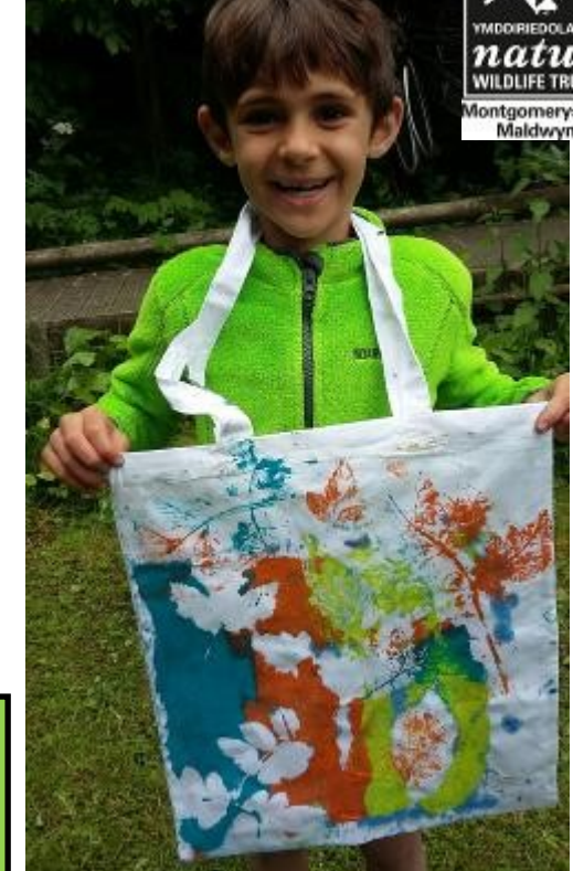
Art Oasis outreach events have provided important opportunities for families to play and be creative together, learning new skills and making new friends